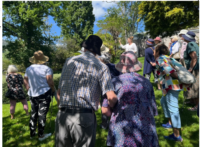
The group during a recent visit to a garden in Hill Street

Contact: Judy Pittman - randjpittman@gmail.com or 03 545 2181